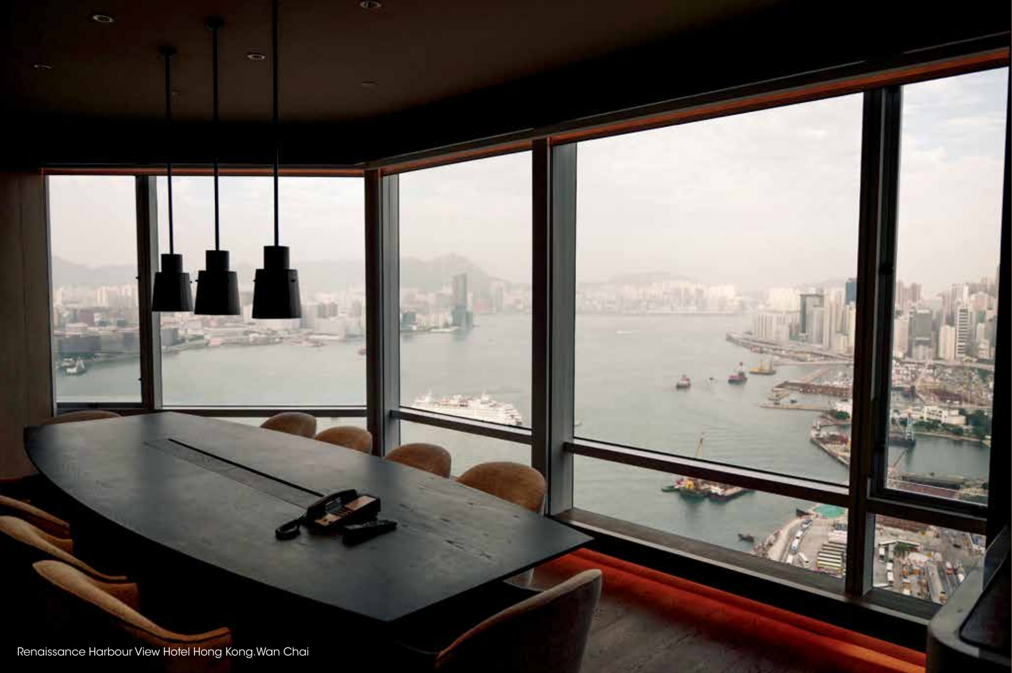
Renaissance Harbour View Hotel Hong Kong, Wan Chai