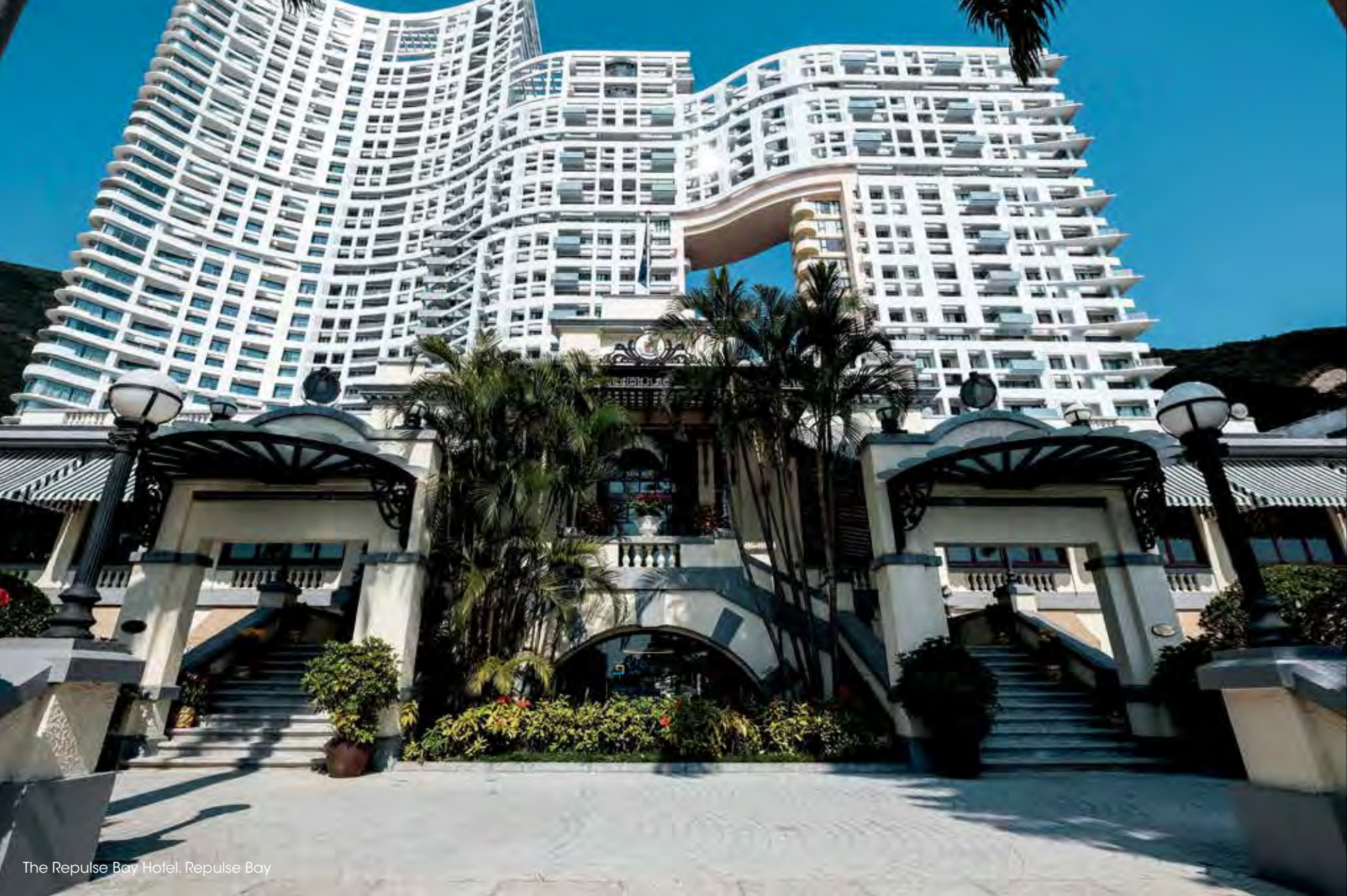
The Repulse Bay Hotel, Repulse Bay